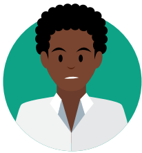
PEOPLE OF COLOR