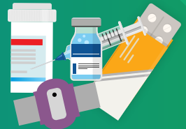
IDENTIFYING AND ACCESSING THE RIGHT TREATMENT