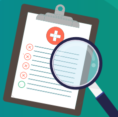
FINDING A DIAGNOSIS